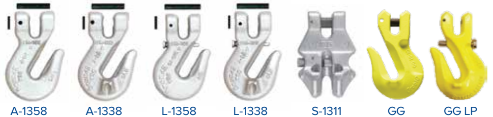
A-1358 A-1338 L-1358 L-1338 S-1311 GG GG LP