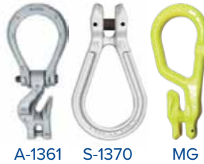
A-1361 S-1370 MG