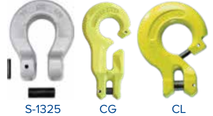
S-1325 CG CL