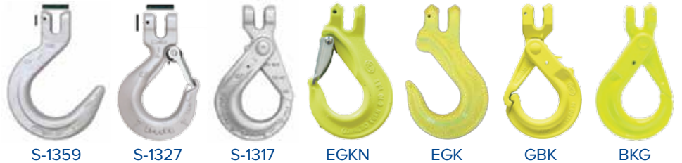
S-1359 S-1327 S-1317 EGKN EGK GBK BKG

The ChainSafe design not only provides the product with an unrivalled strength to weight ratio but it also allows the use of a separate internal sealed enclosure.